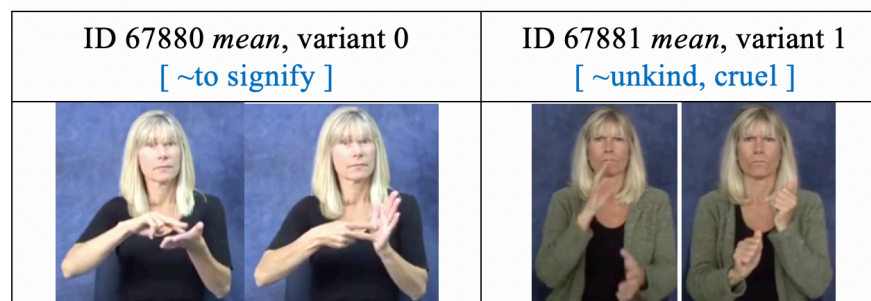
Figure 3. Supposed Dialectal Variants in WLASL