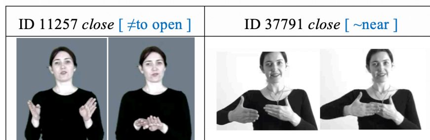
Figure 2. WLASL: same English gloss, different ASL signs