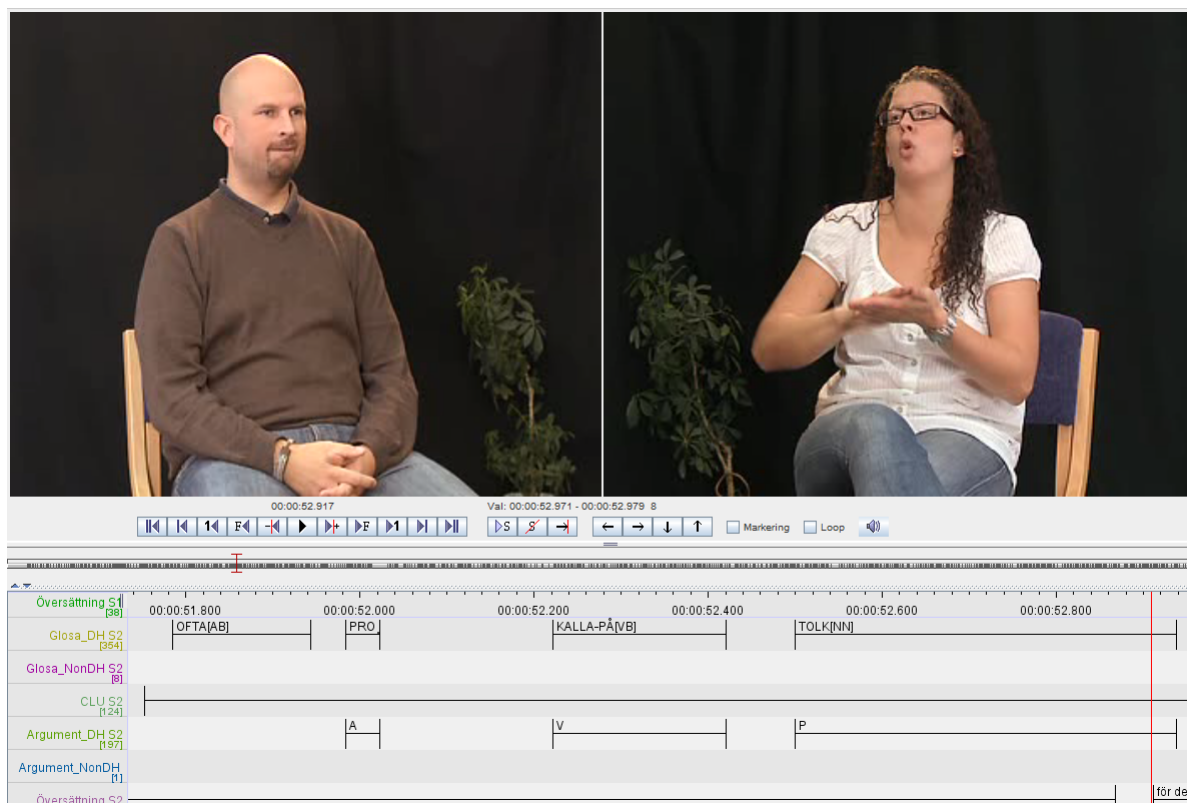
Figure 1: Screen shot of ELAN with the sign gloss, clause segmentation, syntactic annotation, and translation tiers.

gument is co-referent. Such annotations could help resolve some questions with regard to constituent ordering, but also the argument structure of individual verbs.