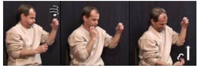
1a: GlossL MOVE+O GlossR BE+O CAT CAT 1b: GlossL MOVE+O GlossR FBUOY CAT CAT BE+O----- MOVE+2 FBUOY FBUOY MOVE+2

annotations to test which approach works best (Cormier, Crasborn, & Bank, 2016).