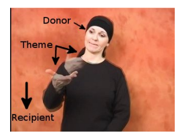
Figure 1: BSL Standard GIVE

In the figures below we give an example of the annotation of the sign GIVE<sup>9</sup> and a Transfer Structure<sup>10</sup> as instances of a GIVING Frame. In the LSF non lexical sign structure, signer Christelle signs "and then she gives her chicks a nice worm" using a complex Transfer Structure combining Situational Transfer (TREE) with Personal Transfer (signer = mother bird) and a clever adaptation of sign GIVE in order to resemble a beak configuration<sup>11</sup>. This example is a clear instance of a whole proposition denoting a GIVING Frame, which cannot easily be mapped into lemma "GIVE". It illustrates the necessity and usefulness of identifying such Frame instances, whether they are expressed with lexical signs or other more complex structures.