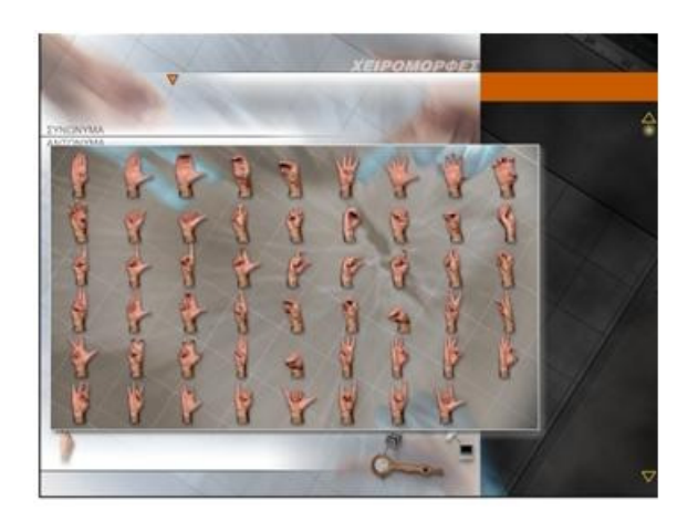
Figure 1: Interface for handshape based search option in the NOEMA dictionary

One of the assets of NOEMA has been the search option in the dictionary content by means of a selected handshape or a combination of handshapes (Figure 1). The latter has been accomplished by annotation on the dictionary database for main as well as secondary handshape(s) used in sign formation for all its lemmas.