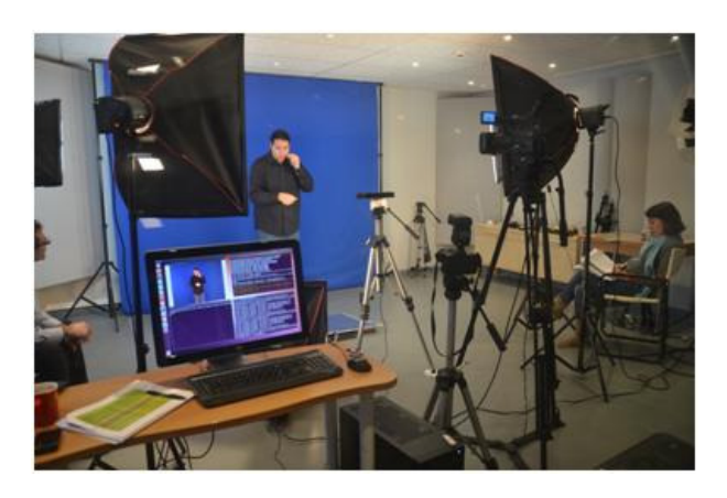
Figure 8: Lexicon acquisition studio set-up

information of sign articulation) are used. The synchronisation of these media is accomplished via clapping<sup>6</sup> as audio cue and flashing as visual cue.