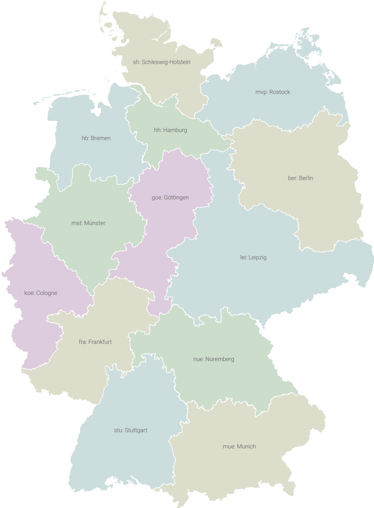
Figure 1: Map of the 13 data collection regions.