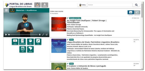
Figure 2: Presentation page of the Academic Materials list with the filters and view by cover.

The graphic interface, in turn, was designed to enable navigation through images, Libras, and written texts. In the presentation of the materials, we sought to explore visual resources along with filters to locate the information more efficiently. To this end, the option was included to view the materials with information such as the cover image and title of the material or photo and name of the authors (Figure 2 and Figure 3).