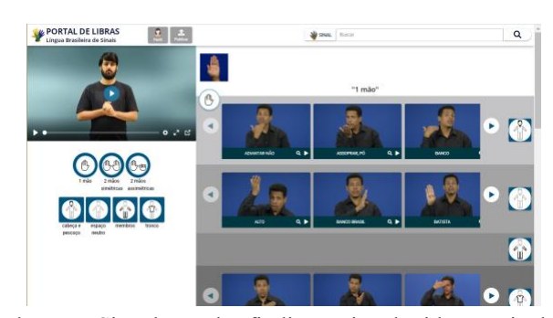
Figure 5: Signal search - finding a signal with a particular hand configuration.

Once a hand configuration is selected, a list of signals is presented in images with the frame in which the signal is made, making it easier to locate the signal. The organization of this list also allows the use of filters to choose to view only the signals made with one hand, two symmetrical hands, or two asymmetrical hands, and at a given location (Figure 5).