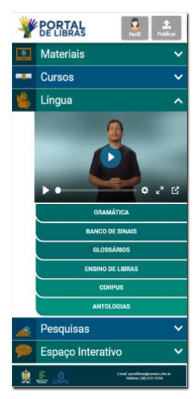
Figure 1: Interface of the Libras Portal, home page

The organization of the materials resulted in a layout that prioritized clarity, using a distribution of information with little depth, i.e., with few clicks required to access any content of the Libras Portal, following information architecture proposals designed by Rosenfeld, Morville and Arango (2015), cf. Figure 1.