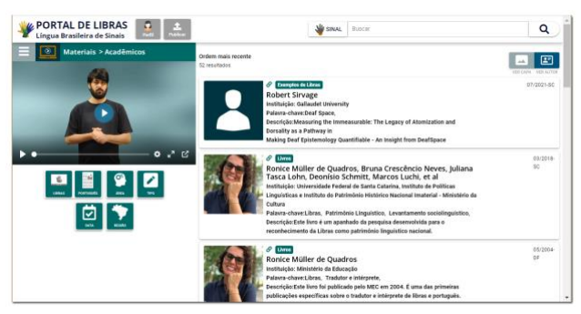
Figure 3: Presentation page of the Academic Materials list with the filters and view by author.