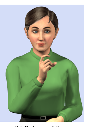
(b) Relocated form