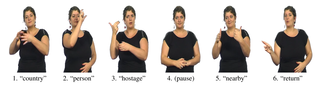
Figure 1: Video snapshots of 1R-JP, one per segment described in section 3.

The second pattern is seen in various places. Below are three excerpts from the whole expression.