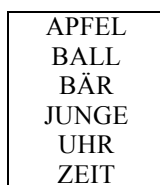
Figure 1: DGS signs under investigation

Creating the mouthings posed several challenges. The TTS library was specific to English, and had occasional difficulties in synthesizing spoken German words. Correcting these instances required manual editing of several of the generated viseme streams.