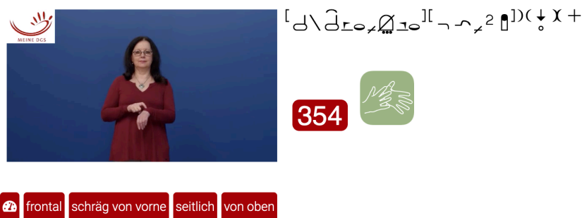
Figure 3: Heading of the entry TIME1^ in the Types list